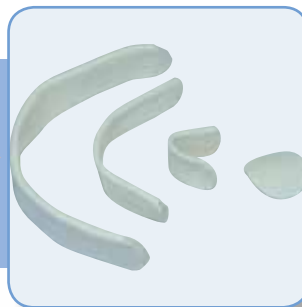
HAND MOLDED RIGID COMPONENTS