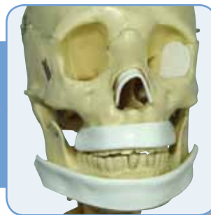
MOLDED COMPONENTS IN POSITION